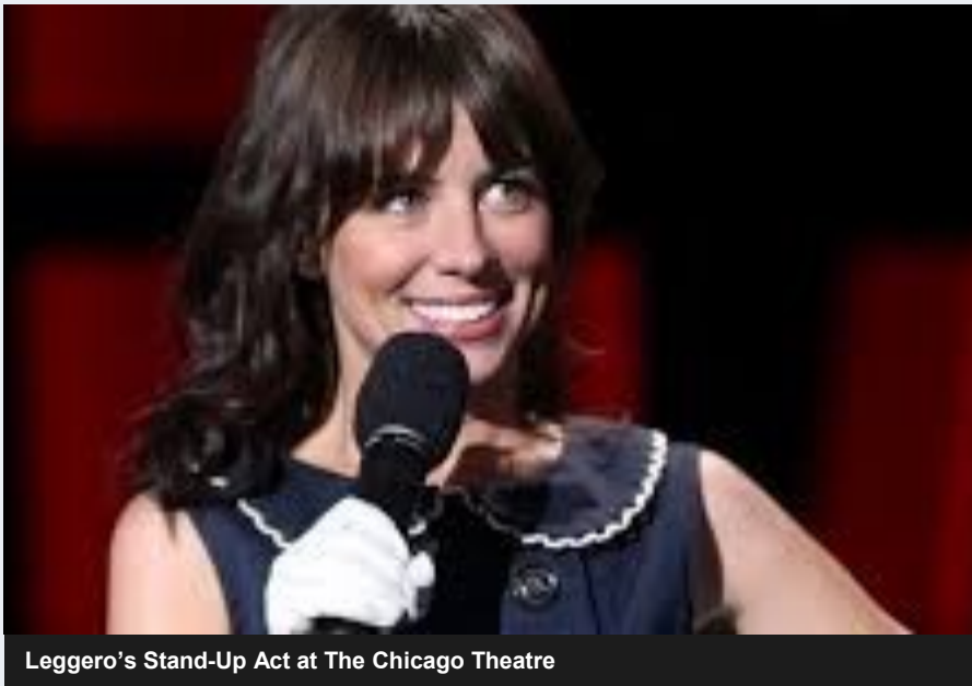
Leggero's Stand-Up Act at The Chicago Theatre